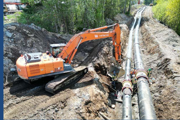
Midtown Water Supply Project

Over this term Council will ensure the City plans, maintains and grows these services as our population grows while ensuring we are fiscally responsible and responsive to the evolving needs of our community.