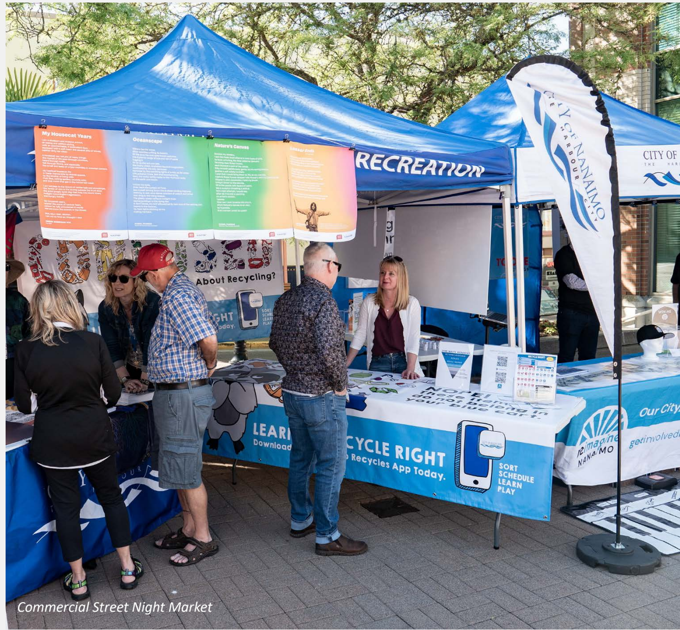
Commercial Street Night Market

We recognize that effective communication is essential to building a strong and vibrant community, and we are committed to this in all aspects of our work.