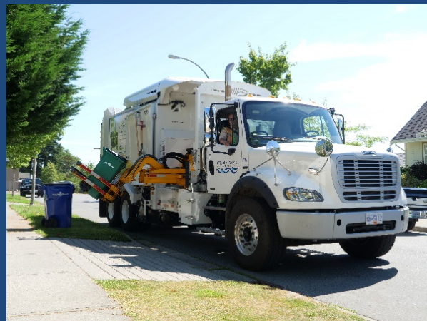
Automated garbage truck