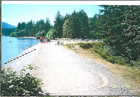
WESTWOOD LAKE DAM

INUNDATION ANALYSIS EMERGENCY PREPAREDNESS RELEASE MODEL WESTWOOD LAKE DAM REHAB Prepared for: City of Nanaimo Emergency Preparedness Coordination Prepared By: City of Nanaimo Engineering Services - GIS March 3, 2008 Data Sources: Inundation Boundary and Timeline: Water Management Consultants Westwood Lake Dam Inundation Study October 5, 2004 Parcels: City of Nanaimo Corporate Land Base